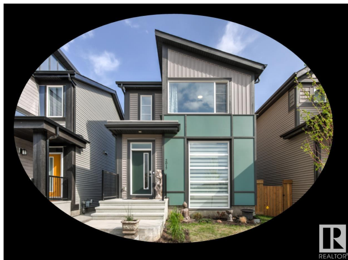
2017 Desrochers Dr SW, Edmonton, AB

Main Floor Exterior Area 742.44 sq ft Interior Area 616.08 sq ft Excluded Area 63.87 sq ft