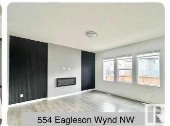
554 Eagleson Wynd NW