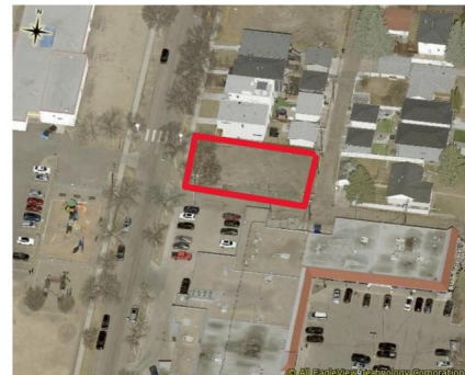
9115 143 St-Location